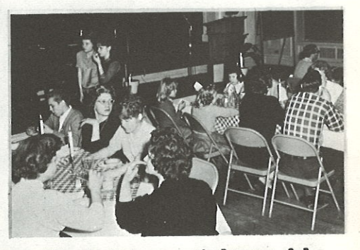
Tired skaters - wholesome fellowship - chili and beverage.